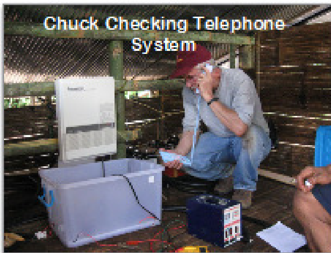
Chuck Checking Telephone System