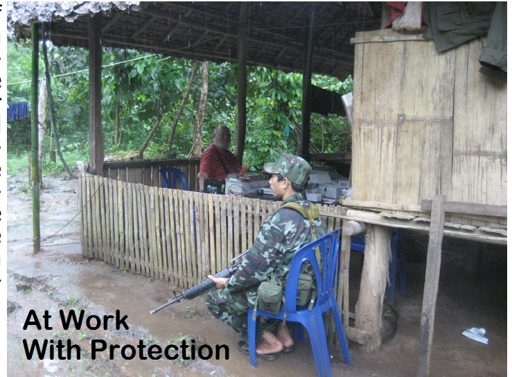
At Work With Protection