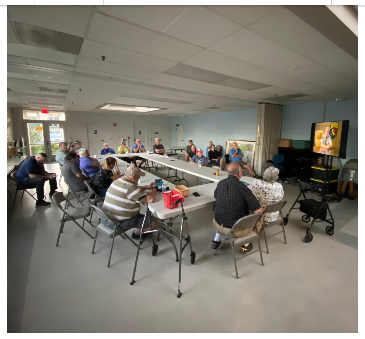
TARC members view video presentation outlining how packet was used to aid fire communications.